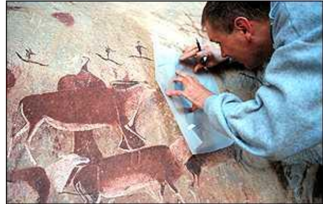
uKhahlamba Drakensberg WHS