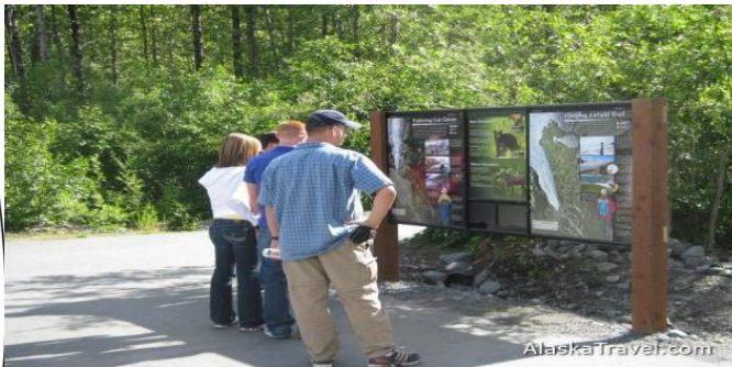
Cape Floral Kingdom WHS