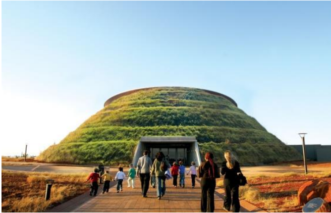
Maropeng: Cradle of Humankind WHS