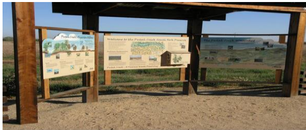
uKhahlamba Drakensberg WHS